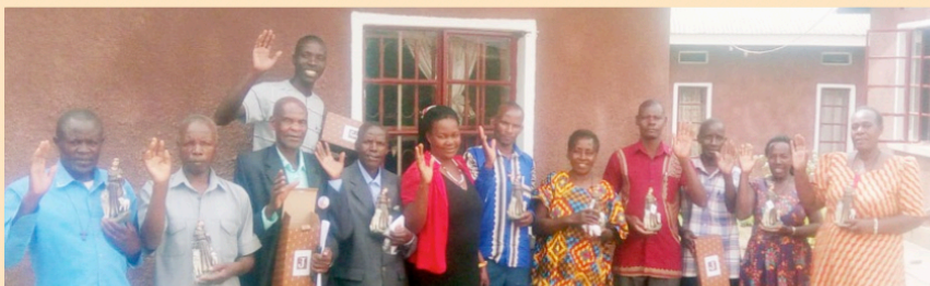
St. Bonaventure Region members with St. Francis statues from Franciscans of the Prairie

May Almighty God bless you abundantly and continue to pray for us to be canonically established as the national fraternity of Uganda and pray