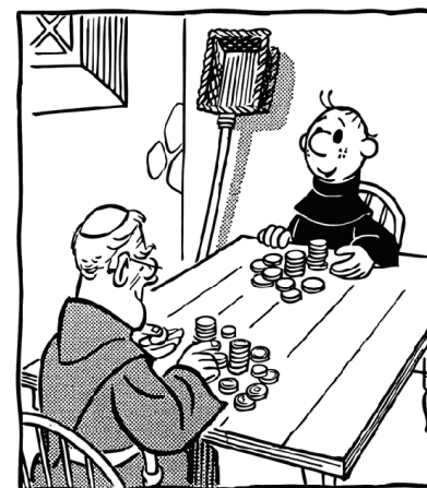
"Y'know, when you come right down to it, our church is COIN-operated!"